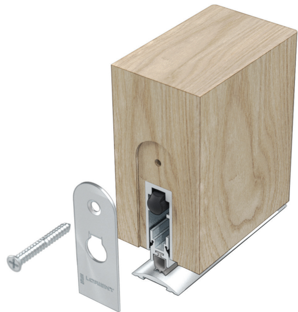
LAS8001 si (shown with LAS4001)